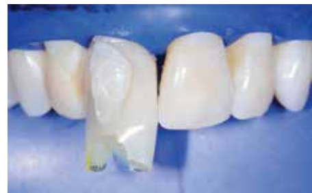
FIGURE 9. The first tooth has been overmolded and matrices removed. Note the orange color along the incisal edge where the adhesive was transported to.