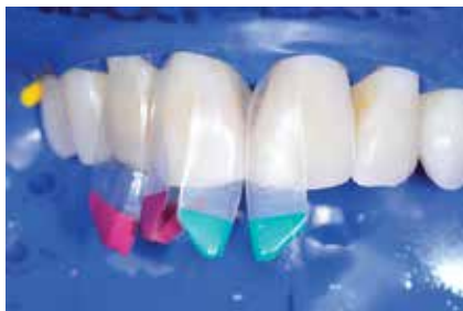
FIGURE 7. At the midline area, the gauge was between yellow and green. The patient wanted absolute closure of the black triangle, so the green matrices were used. For a slightly open embrasure, the yellow matrices would have been utilized. The other embrasures were restored with the pink matrices. The “large” matrices from the “large” tub were utilized for this case. The “small” matrices are commonly used for lower incisors.