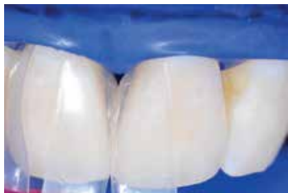
FIGURE 8. A high-magnification view of the aggressive curvature of the black triangle matrices and tight gingival seal is demonstrated. If the contacts are not appropriately lightened with the sander mentioned previously, the operator may see a gingival gap. This indicates that the matrix is not fully seated, the matrices should be removed, the contact sanded more aggressively and then matrices reinserted.