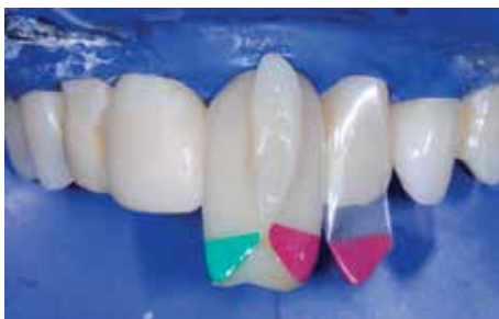
FIGURE 11. The left central incisor is overmolded. The “shepherd” matrix on the mesial of the lateral is currently inactive but will later be used as an active or “aquarium” matrix.