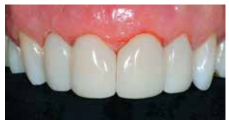
FIGURE 13. Immediate postoperative view. Note the ultra-glossy finish imparted by the polish. Monolithic injection molded composite holds real promise as the structural and optical integrity of the composite, Filtek Supreme Ultra, is maximized.

The immediate postoperative photograph ( FIGURE 13 ) demonstrates immediate and complete black triangle closures. The matrices are specifically