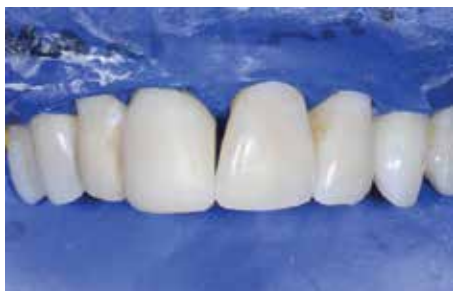
FIGURE 10. The excess or “umbilicus” has been quickly amputated with a dry coarse diamond bur; the tooth is then taken to the 80% completion state with a SoFlex XT Coarse disk (3M) before moving on to the next tooth.