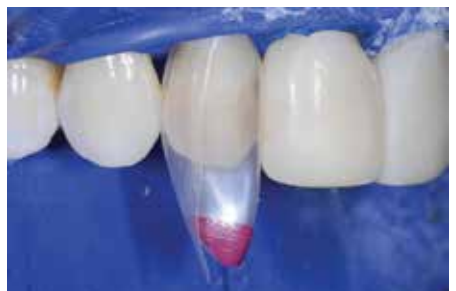
FIGURE 12. The mesial is treated with the pink matrix and the distal is treated with the Bioclear A-102 matrix from the original Bioclear System in the HD thickness. Because the contacts were all naturally occurring in this case, the slightly thicker HD matrices can be used. The HD version of Bioclear Mylar at 75 microns is significantly stronger and stiffer than the 50-micron version. Each thickness version is used depending on the clinical situation.

is repeated one tooth at a time ( FIGURES 11 and 12 ). The single porcelain veneer on tooth No. 7 was removed and replaced with the same basic injection overmolding process used on the other teeth. Because the original porcelain veneer was very conservative, no dentin was exposed. Another aid was the fact that the contacts were still present in enamel, which is very helpful to the clinician as the matrices are stabilized nicely.